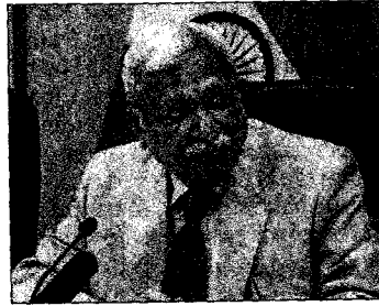
CEC Sunil Arora.

The EC, however, did not declare the schedule of the elections for Jharkhand, where the term of the